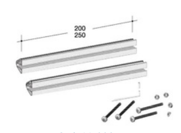
Cod. 11-003 Pair of 200 mm silver anodised aluminium bars with M4x50 screws and nuts